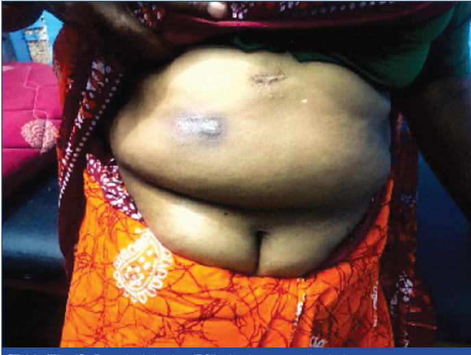
[Table/Fig-6]: Port site infection (PSI) after laparoscopic cholecystectomy.

for histopathological examination and Cartridge Based Nucleic Acid Amplification Test (CBNAAT), where Mycobacterium tuberculosis was found in three cases and atypical mycobacteria in six cases. Secondary suturing was required in 24 patients with SSI (25.8%). The mean postoperative stay was 32.35±22.7 days in those who developed SSI, compared to 7.19±5.13 days in those who did not (p-value <0.0001). Approximately 54 (58.07%) patients developed